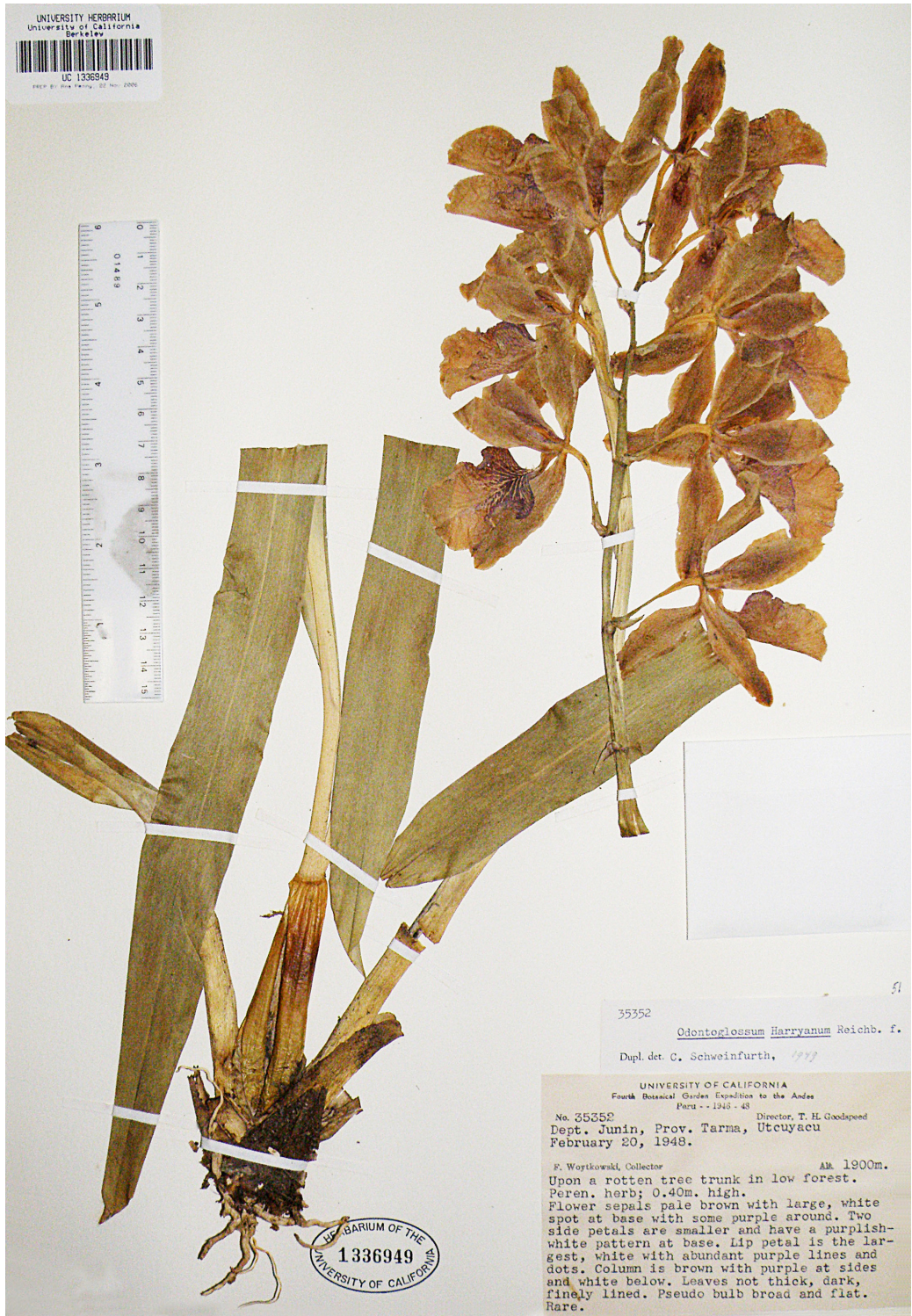
FIGURE 2. Odontoglossum wyattianum . Holotype, F. Woytkowski 35352 (UC-Berkeley).